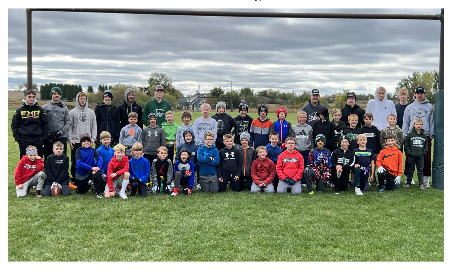
5th & 6th Grade Tackle Football