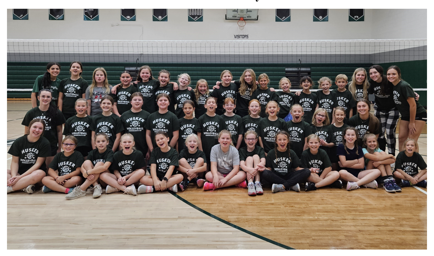
1st - 3rd Grade Volleyball