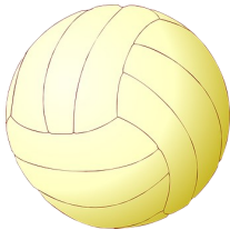
Pictured Right: 4th—6th Grade Volleyball