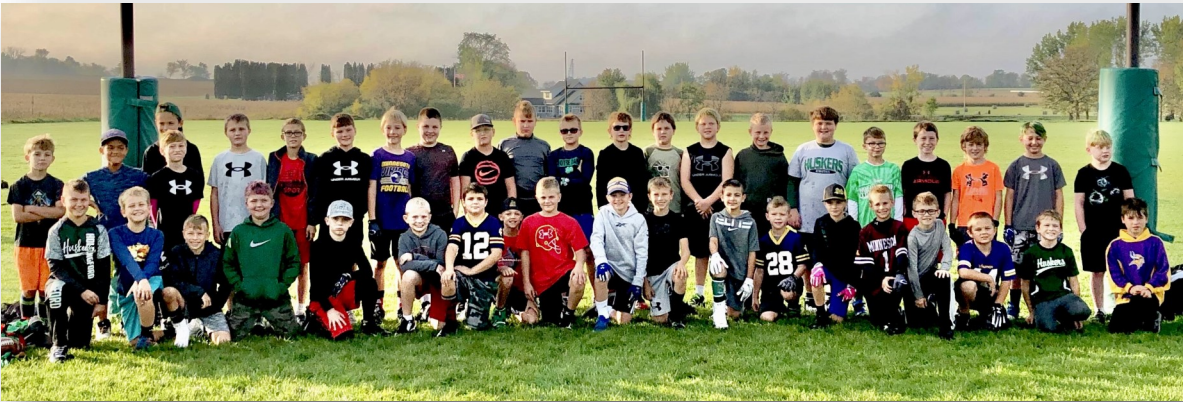
Pictured Left: 3rd & 4th Grade Flag Football