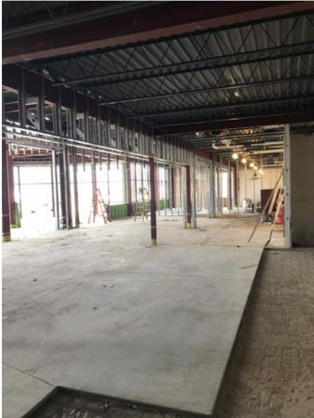
High School/Middle School Commons Addition: Framing for office walls beginning