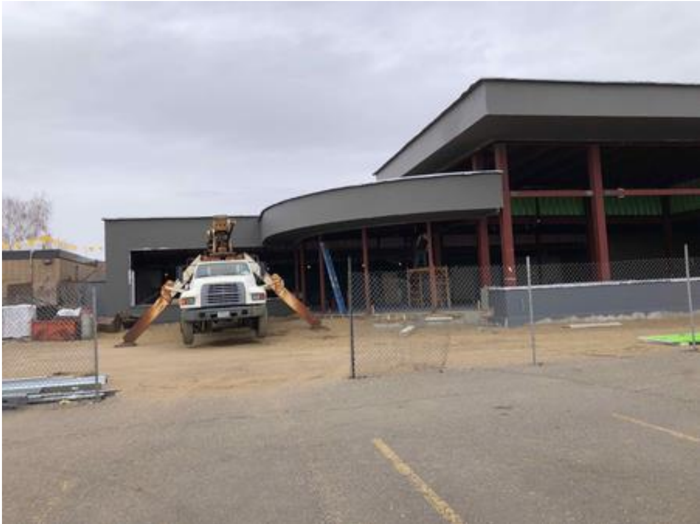
High School/Middle School Commons Addition: Exterior air barrier applied. Brick and parapet flashing to follow.