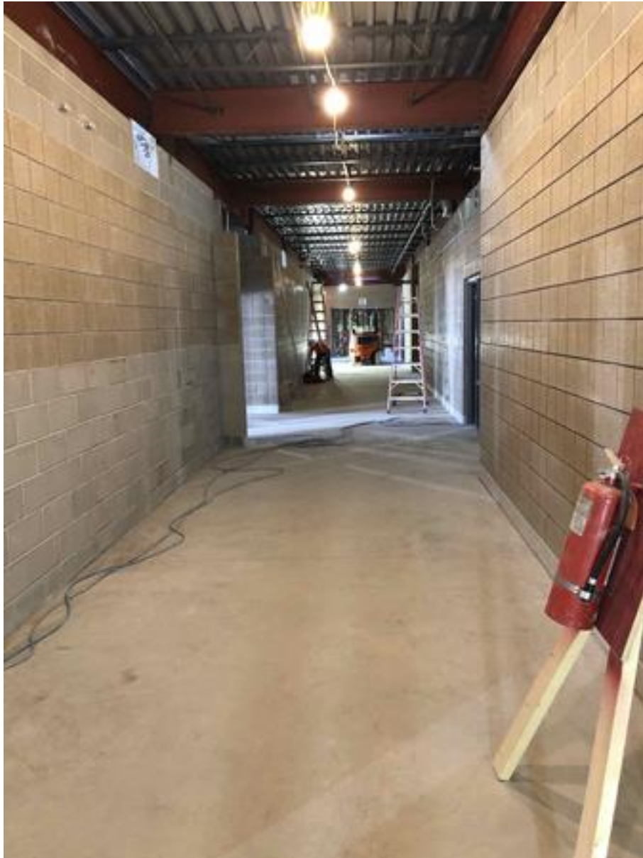
Elementary Classroom Addition Completed masonry walls down corridor