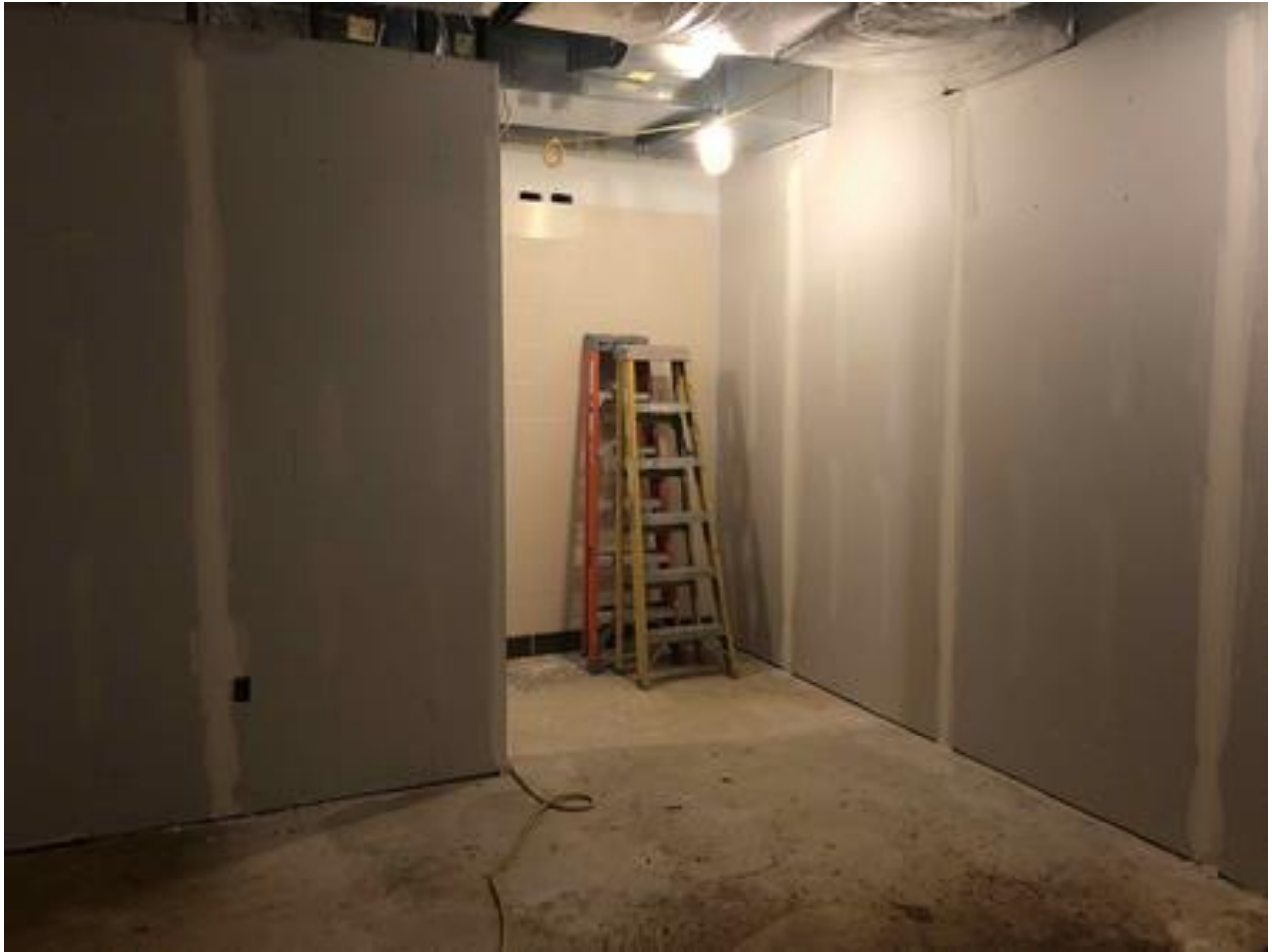
Team Room/Offices: Framing, sheetrock and taping complete, painting to follow