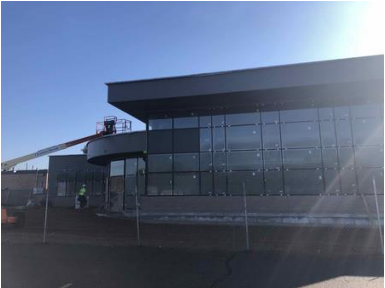
High School/Middle School Commons Addition: Glazing installed, brick complete, metal panels to follow